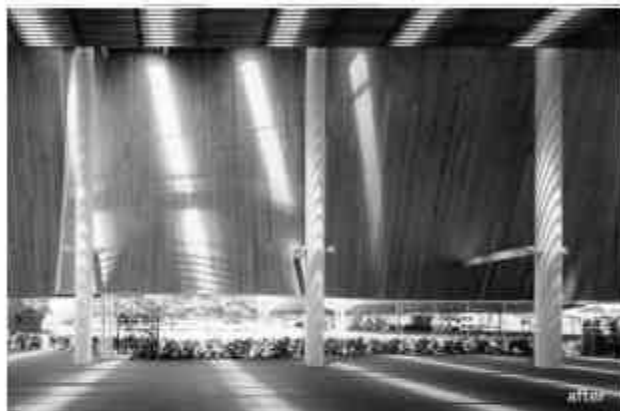
Sea Museum in Kamae 2005/3 Kamae-town Ohta-prefecture