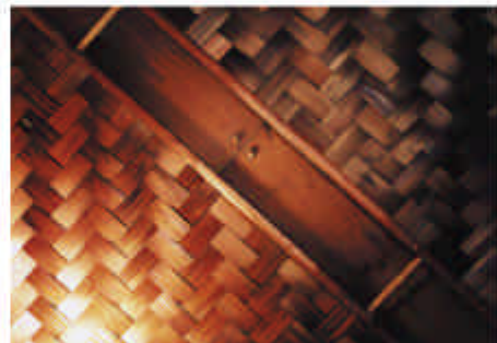
a vent established on the ceiling

Cool tube is an airway carrying the air from west side of the building to the living room. The heated air cools down by the earth temperature. The gateway of the tube is implanted in the step of the Tatami.